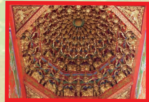
5 the "Bagua" 八卦

Assembled from 10,000 embedded wood parts