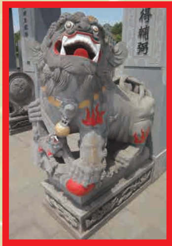
A pair of "Fu lions"; "guardian lions" carved from a single stone

History of the temple and about the religion Taoism, is written on the signboards outside.