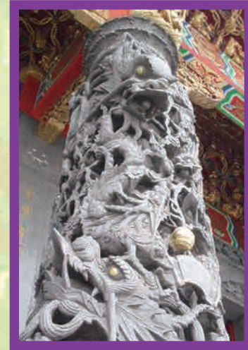
Pillar of 9 dragons East, dragons are auspicious and do not need wings to fly.