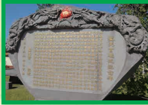
Commemorative stone monument

Carved from a single stone. All words are embossed and gilded in gold leaf